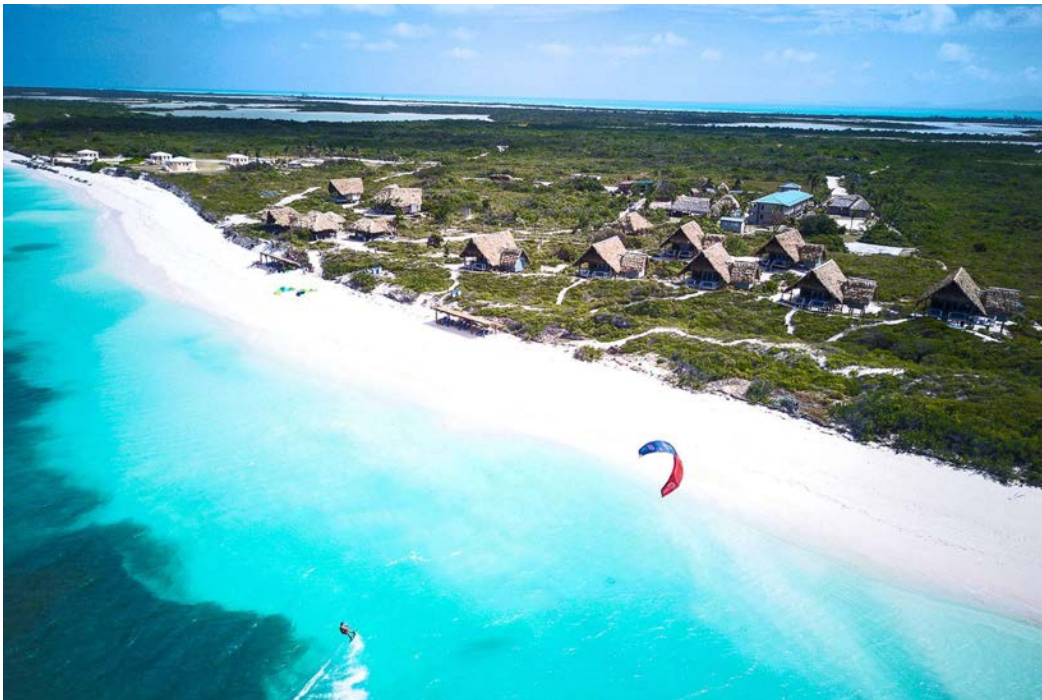
Anegada Beach Club

The only morning we don't recommend a leisurely start and suggest a slightly earlier breakfast, still à la carte choices, but in order to get you to the beach by the latest 10:30. Ashore there are a few options. Head out to Loblolly beach with your snorkel gear in an open air safari taxi or guests are encouraged to rent out a scooter from a local company. You will have an absolute blast! It is very simple to pick up and the roads are smooth and easy to handle. It's a fantastic sense of freedom to zoom around on your own wheels as we drive the 20 minutes to the beach. Lunch is can be served upon your return or you can enjoy some local conch at a beach restaurant. Guests can enjoy what must be one of the most stunning spots on the planet. Big Bamboo Bar and Restaurant, Cow Reck Beach , Anegada Beach Club are just a few to mention and unless guests would prefer to spend another night in Anegada and as always we are completely flexible and try our best to match the itinerary to the mood. Otherwise pack up and take the taxi scooter trip back to the yacht. From here we sail down to Guana Island and spend the night in White Bay or Lee Bay, Great Camanoe, depending on the weather.