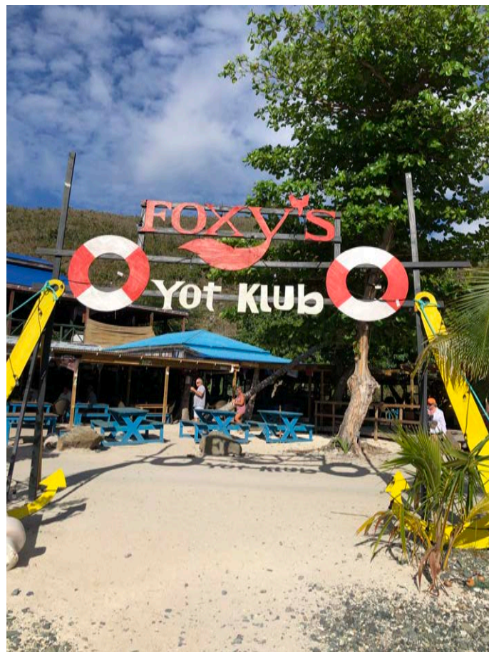
Foxy's Bar on Jost Van Dyke

Breakfast aboard, followed by a 45 min downwind sail to Sandy Spit. This tiny sandy cay off Green Cay makes one think what mutineers on deserted islands must have experienced, but with a cold drink in your hand it makes for a better place to walk with your friends and family and enjoy sun and sand for one last day. It's a great place to Stand up Paddle board or to kayak or sunbathe on the trampolines before lunch. Then it is off to Great Harbor where the Infamous Foxy's Bar is up and running. Alternatively a stop at the Soggy Dollar Bar could lead to a festive day drinking the famous Painkiller cocktails. The gift shops are open and this the place to get your BVI souvenirs or T-shirts. Nearby in White Bay is Hendo's Hideout and serves great Conch Fritters. A true local experience and highly recommend. Guests then have the option of of anchoring overnight in Great Harbor on Jost Van Dyke or Little Harbor or White Bay. Alternatively you can head down to Christmas Cove in the USVI, late in the afternoon. This allows for a slower morning on your last day and is your best chance to see the green turtles that frequent the bay and enjoy a last swim in the morning.